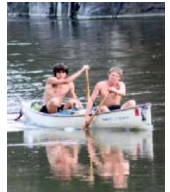
Paddling Against the Current Bloomfield & Witte

Everyone Welcome Free Admission Questions: 1-877-269-2873